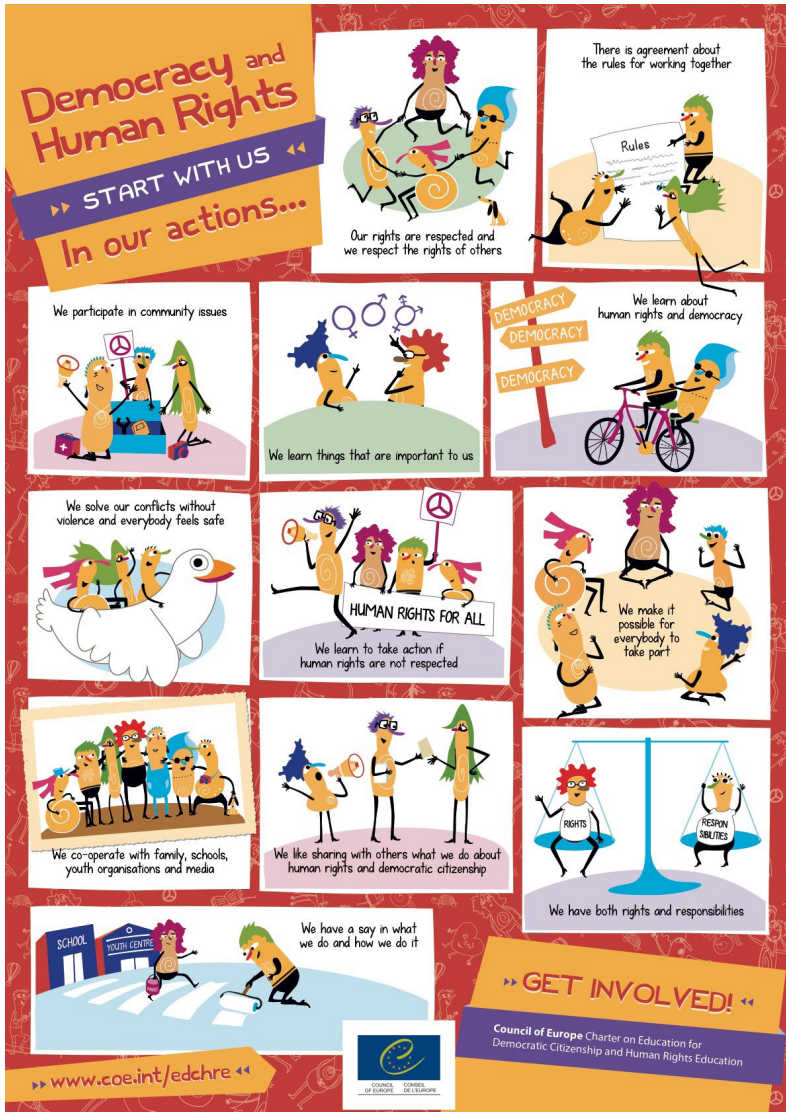
Figure 5. Democracy and Human Rights Poster 21