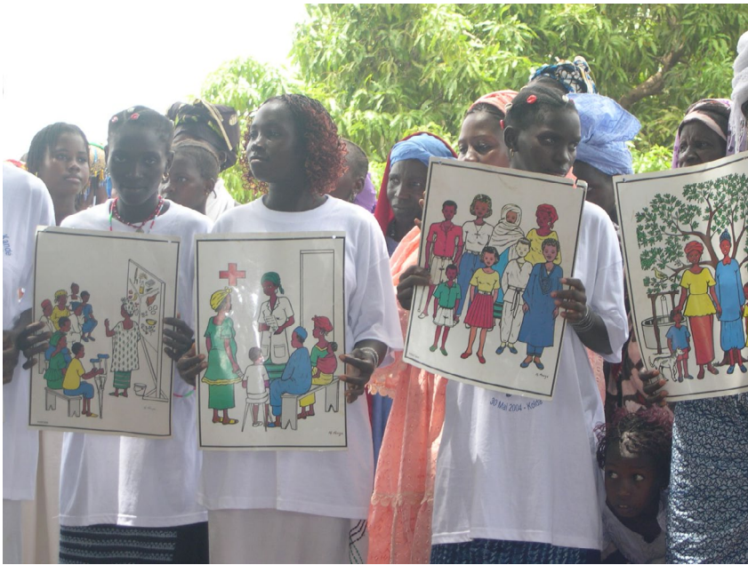
Figure 2. An Example of the Images Used by Tostan Facilitators in Class © 2004, Gerry Mackie

and the world. They are also asked what responsibilities come with this right. Then they are asked what their culture and religion teach about this human right. Although Shining Stars describes possible ways to apply knowledge to action, this first session on a specific human right urges participants to undertake a specific action: form groups of 5-10, each to survey the principal causes of death in a part of the community and ascertain what is being done or could be done to prevent death and injury. The next session starts with an overview of different types of mortality and the existing or possible measures to reduce death and injury.