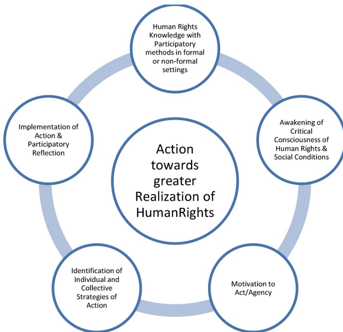
Figure 1: Participatory Dimensions of Transformative Human Rights Education

THRED can happen in formal, non-formal and informal settings. Many HRE scholars and practitioners have been inspired by the participatory educational model in their work (see, for instance, the work by Marks 1983, Meintjes 1997; Claude 1999, 2000; Koenig 2001; Lohrenscheit 2002; Tibbits 2002; Suárez 2007; Print et al. 2008; Bajaj 2011). Some have been successful, within their contexts, in bringing the THRED approach to the school context (see the India case that follows in this Appendix, Bajaj 2012), demonstrating how this can bear positive results. While the existing literature mostly focuses on the formal settings, there is still much to learn about the potential of THRED in non-formal settings. Initial research suggests that in non-formal settings THRED has the potential to reach sectors of the population that do not have access to formal education; research also shows that their participation can be highly beneficial both to them and to others in their setting (see the case of Tostan in this Appendix).