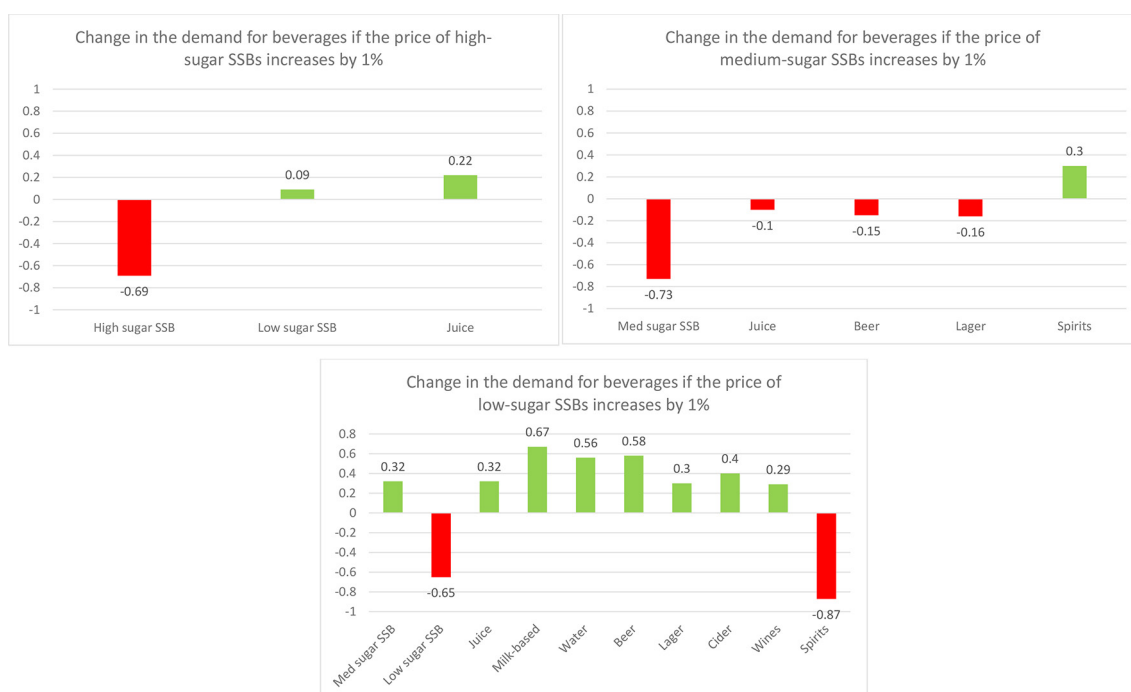
Figure 2 Change in the demand if price of SSBs increases (low-income sample; N=198 464). High-sugar SSBs include >8g of sugar per 100mL; medium-sugar SSBs include 5–8g of sugar/100mL and low-sugar SSBs have <5g of sugar/100mL.

middle-income group and decrease in cider for the high-income group. An increase in the price of medium-sugar drinks tends to reduce purchase of beer, and lager across all income groups, generating a ‘healthy multiplier’ effect for the price increase. An increase in the price of diet/low-sugar drinks, however, generates increased purchase of all categories of alcohol with the exception of spirits. On balance, a policy to increase the price of SSB needs