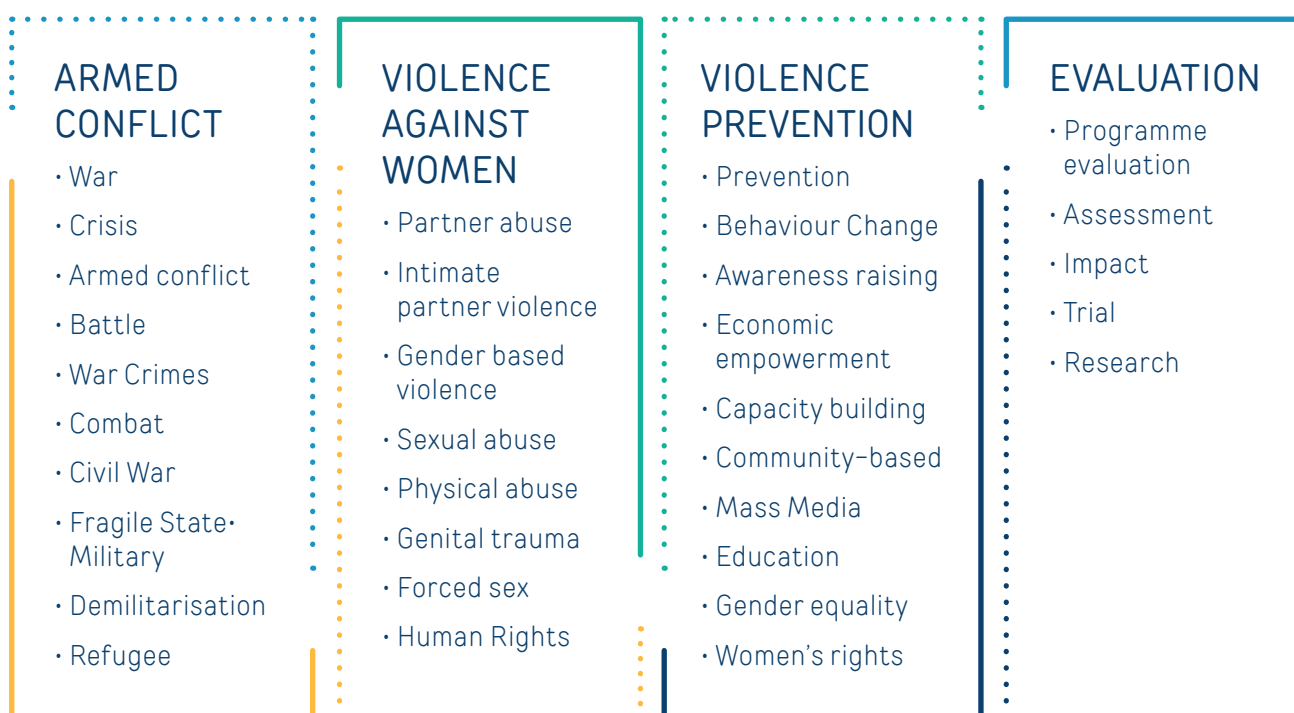
FIGURE A.1. SEARCH TERMS

A combination of terms was used relating to armed conflict, violence against women, prevention and evaluation. Boolean statements were used in each sub-category.