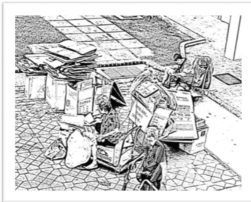
Fig. 4. ‘Lots of cardboard today’: three older adults sorting through recycling materials. (photovoice filtered image)