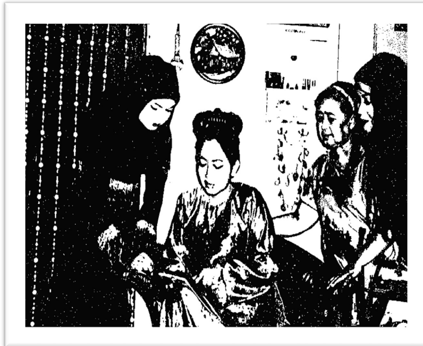
Fig. 3. Friends and family gathered at home to prepare Malay festival, Hari Raya Puasa. (photovoice filtered image)

This fear of gossip and conflict increased their wariness to expand their social network and join community activities. Similarly, participants relayed how gossip in community activities led some older adults to discontinue these activities. These older adults valued the intimacy of social interactions with familiar people which they perceived brought about safer and more meaningful interactions, compared to community activities which could seem more focused on external program elements, such as quantity of turnout.