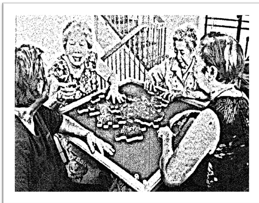
Fig. 2. 'Love for mah-jong': older Chinese women gathering to play. (photovoice filtered image)

For other older adults, focusing on social interaction with familiar people and activities was a way to regulate and simplify their social life. They perceived benefits in doing so, to reduce the complexity that came with interacting with new people in new social situations. Not getting along with someone, or meeting someone who could not be trusted, were perceived as potentially troublesome events that should be avoided. For example, in the CFGD, one participant explained how they preferred to avoid community activities and stick to inner social circles 'in case they offend some people. Gossiping. Sometimes you may not say anything but others accuse that you say certain things.' (CFGD3)