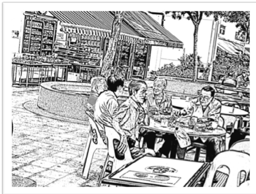
Fig. 1. 'Hanging out in the market together': older Chinese men enjoy their daily chitchat. (Photovoice filtered image)

While cultural grouping contributed to a low visibility of ethnic minorities in mainstream community activities organized by the grassroots organizations (RCs), the problem was also exacerbated by a lack of cultural attractiveness of these activities for ethnic minorities. Because many of the organizing committees in RCs were predominantly run by Chinese members, this may explain an unintentional lack of cultural sensitivity and variety of these activities for the ethnic minorities. WTS community leaders shared how many of these activities outwardly appeared structured towards the Chinese in terms of types of activities, food (e.g. non-halal for Malays) and language translation.