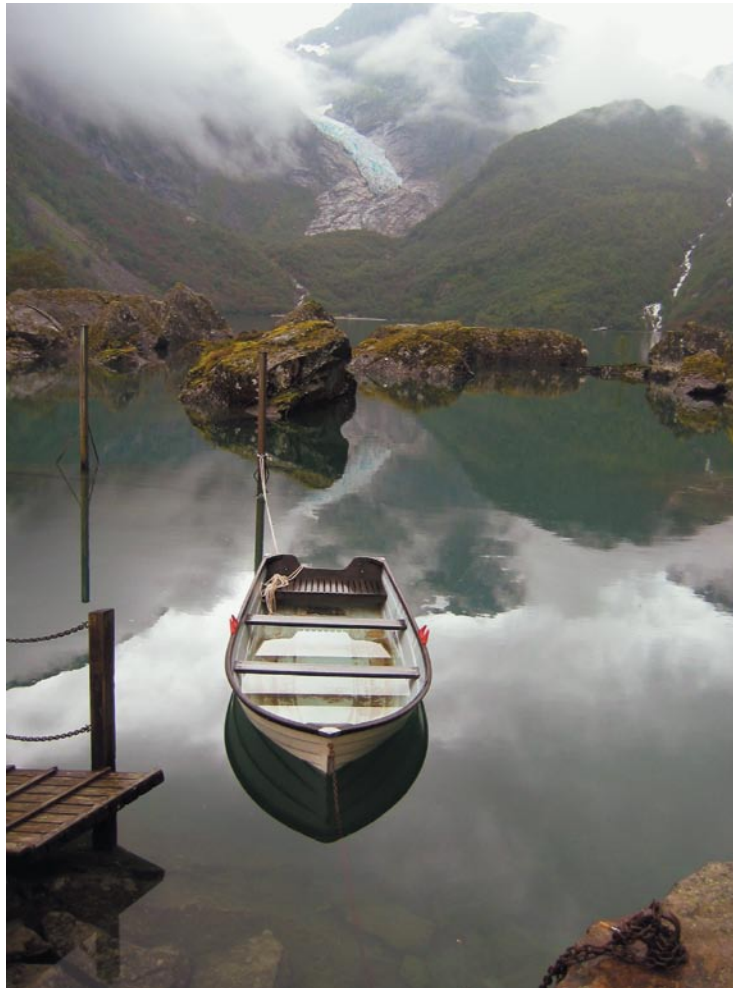
Folgefonna National Park, Sweden

Copyright © 2010 Massachusetts Medical Society.