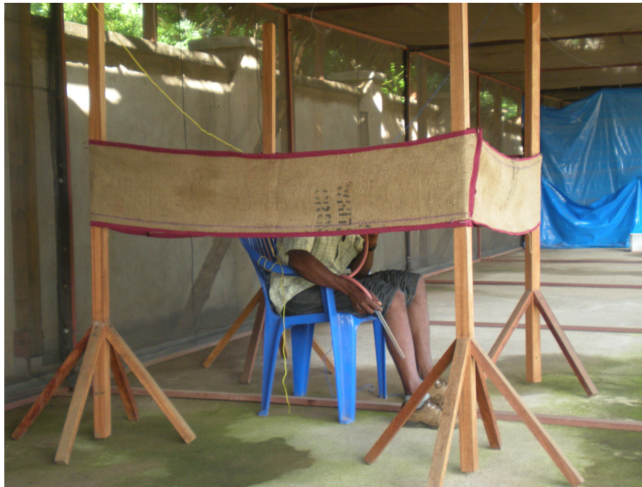
Figure 1 Transfluthrin hessian strip. The hessian strip is made from fine sisal fiber woven together to make sacking fabric. The strip is 4 × 0.3 m long. It is treated with transfluthrin. The strip is suspended on 4 wooden poles making approximately 1 m 2 area surrounding the human participant conducting mosquito catches.

The freshly treated sisal strip provided > 99% protective efficacy against mosquitoes: In the first round of assays only 1 mosquito out of 200 that were released was recovered by the volunteer in the experimental unit with a treated strip, while 148 out of 200 released mosquitoes were recovered in the unit with an untreated control. The treated strip continued to consistently confer > 99% protective efficacy for a period of 6 months and all assay rounds, except one during the fourth month, indicated approximately 91% protective efficacy. Over the entire study period only 22 out of 1400 mosquitoes released into the experimental unit with the treated sacking strip were recovered by the protected human catcher. In stark contrast, 894 out of 1400 released mosquitoes bit the volunteers using an untreated sacking strip (Figure 2).