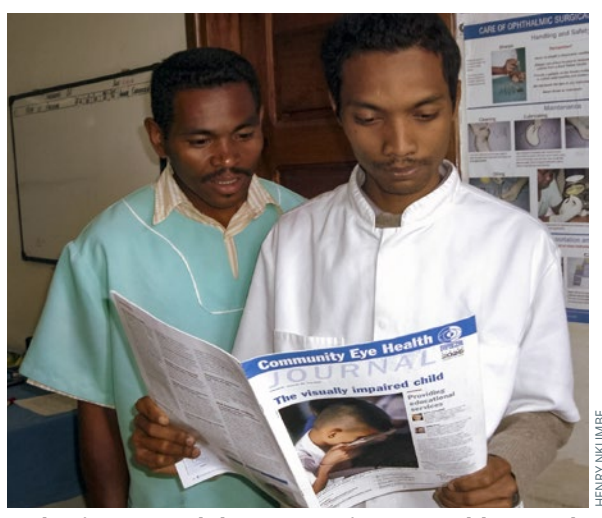
Make time to read the Community Eye Health Journal. MADAGASCAR