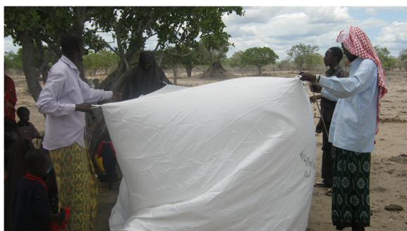
Figure 1 The Dumuria LLIN. A Dumuria net being displayed in the field.

In September 2011, a total of 13,922 Dumuria nets were distributed to 8,511 nomadic households in Garissa county, providing an average coverage rate of 1.64 nets