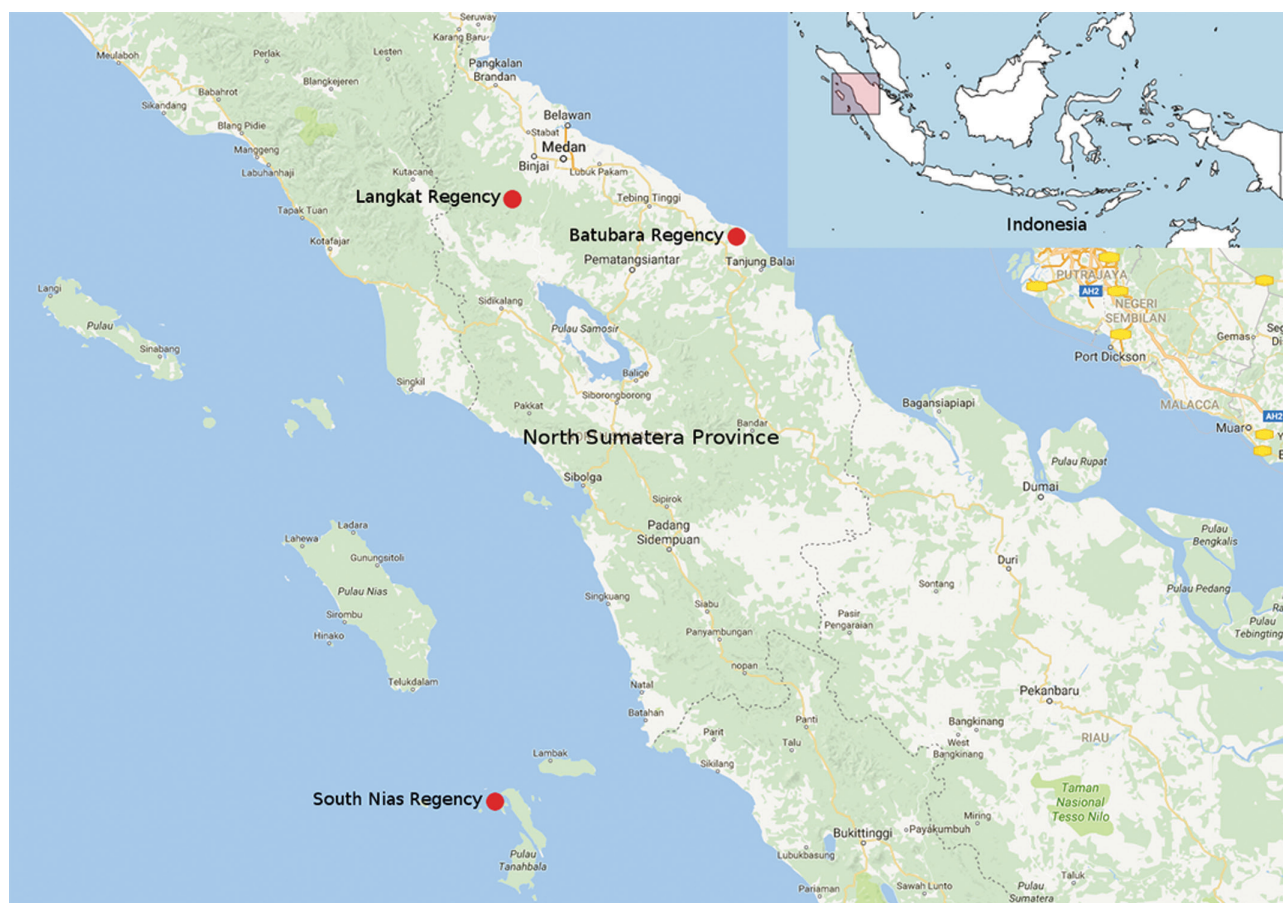
Figure 1. Map of North Sumatera province, Indonesia. The 3 studied regencies (Batubara, Langkat, and South Nias) are indicated.

Sampling strategies differed among the 3 sites, owing to contrasting geography and inconsistencies in access to health facilities. In Batubara, most communities had good access to a health clinic, which was open to patients from 8 am to noon, 6 days per week. We established a 24-hour, 7-day clinic for an 8-week period of screening, after intensive health promotion and education on malaria and sensitization concerning to our study objectives. This sensitization was facilitated by local leaders and carried out at the level of the whole community, but clinic attendance was entirely voluntary. Thus, sampling was not designed to reach the whole community. Local health clinics were also