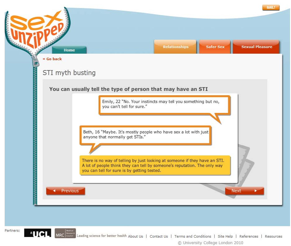
Figure 4. Example quotations.

The website also includes quotations with aliases reflecting a range of views intending to give the feel of a peer-to-peer exchange of views (Figure 4).