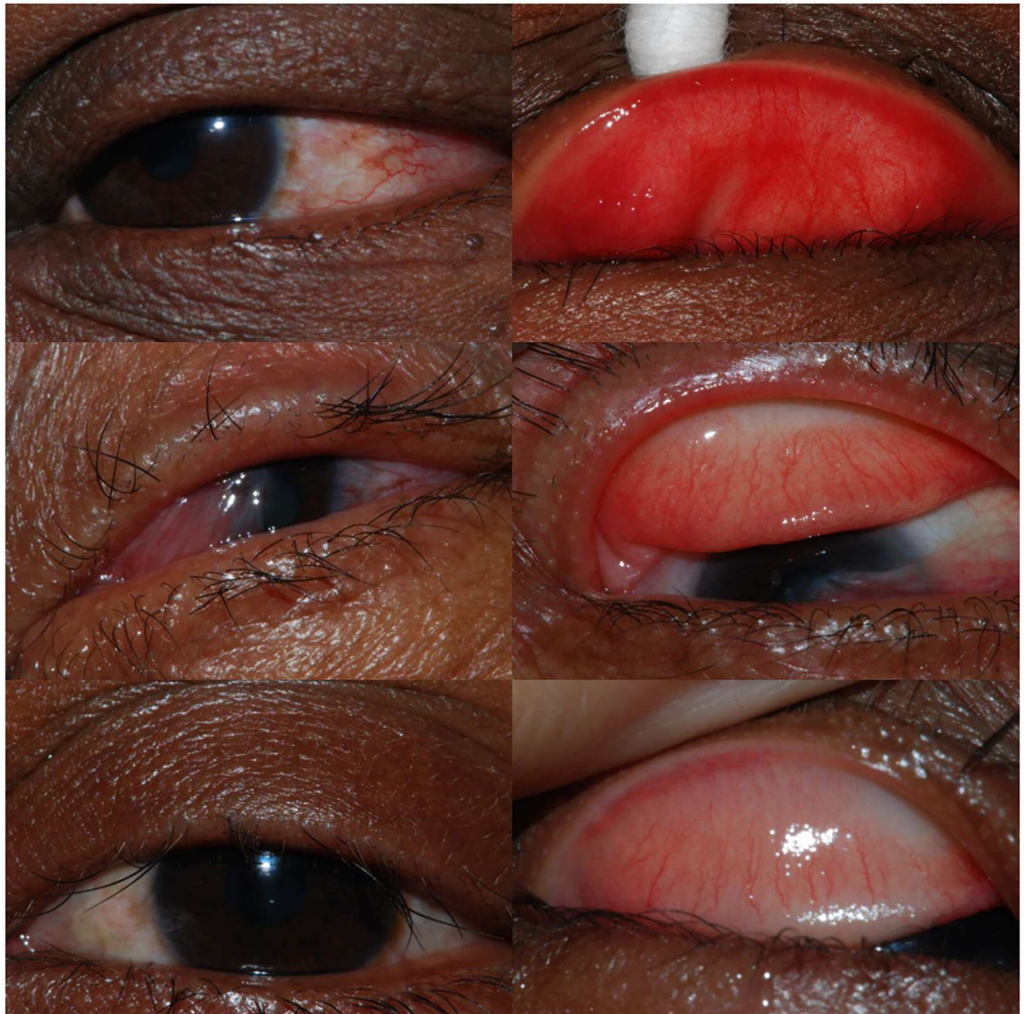
Fig 3. Front-of-eye and conjunctival photographs of individuals who removed (Bottom) 2–10 eyelashes, (Middle) >10 eyelashes (with pterygium), or (Top) most or all of the eyelashes; Western Division, Fiji, 2015.