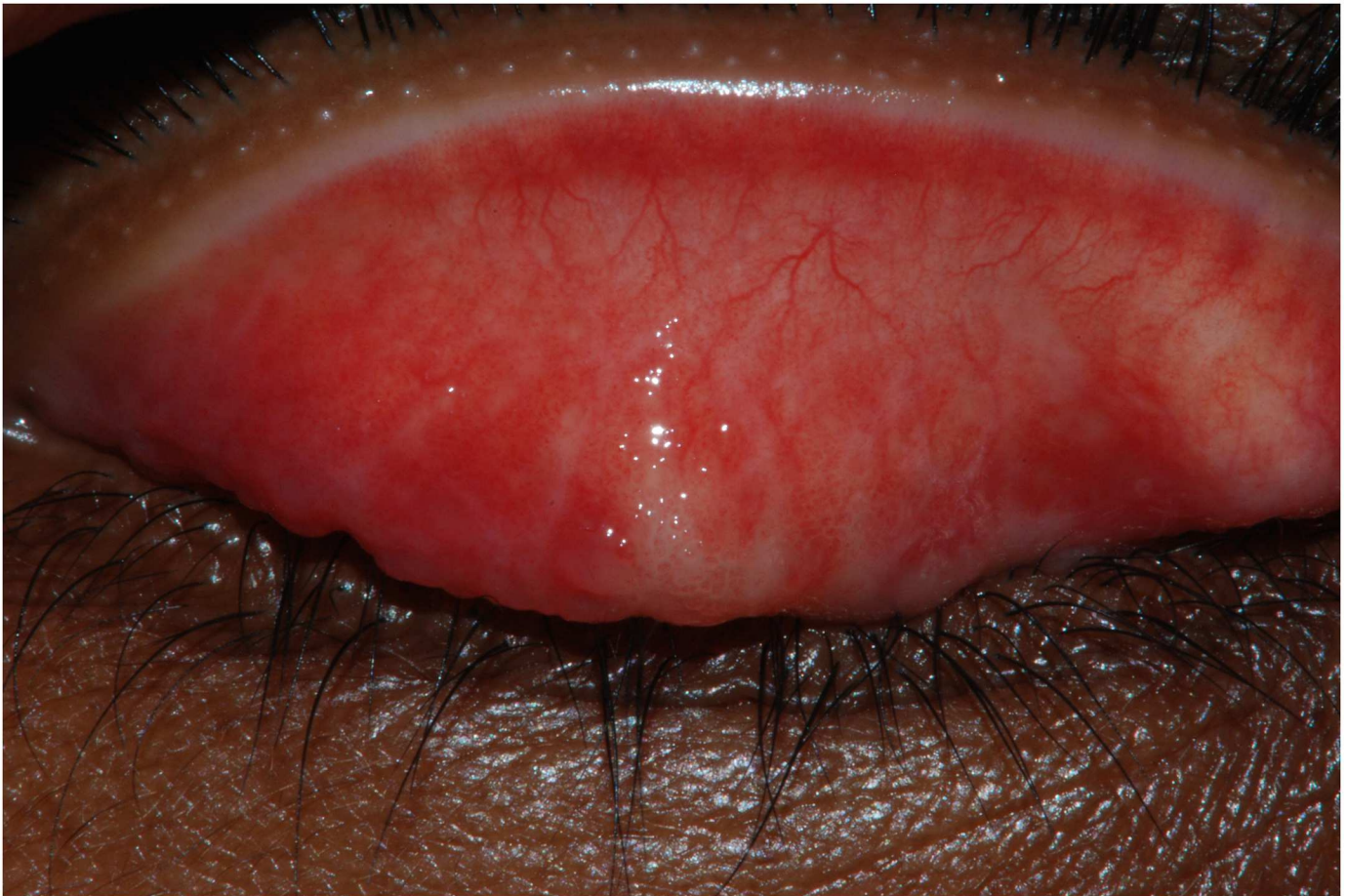
Fig 2. Conjunctival photograph of the individual felt to demonstrate equivocal evidence of conjunctival scar, Western Division, Fiji, 2015.