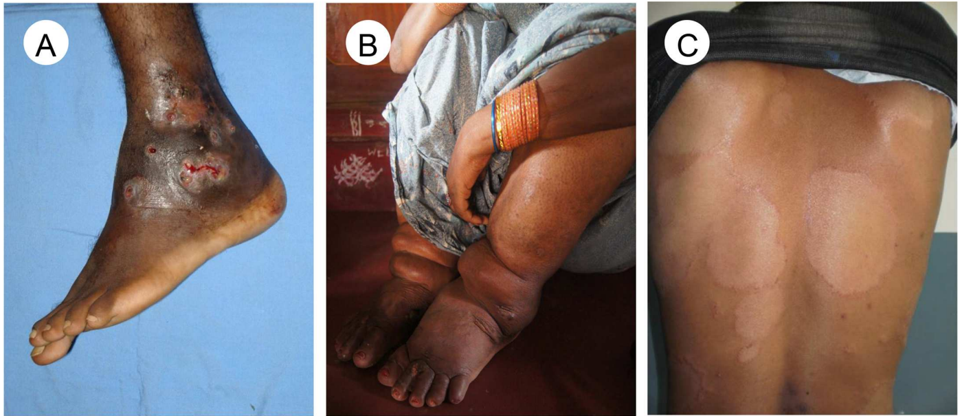
Fig 2. Common skin neglected tropical diseases lesions. (A) Mycetoma with few active sinuses, grains, and discharge, (B) Bilateral lymphoedema of both legs in the late stage of lymphatic filariasis, (C) Hypopigmented anaesthetic macules with infiltrated edge of borderline tuberculoid leprosy.