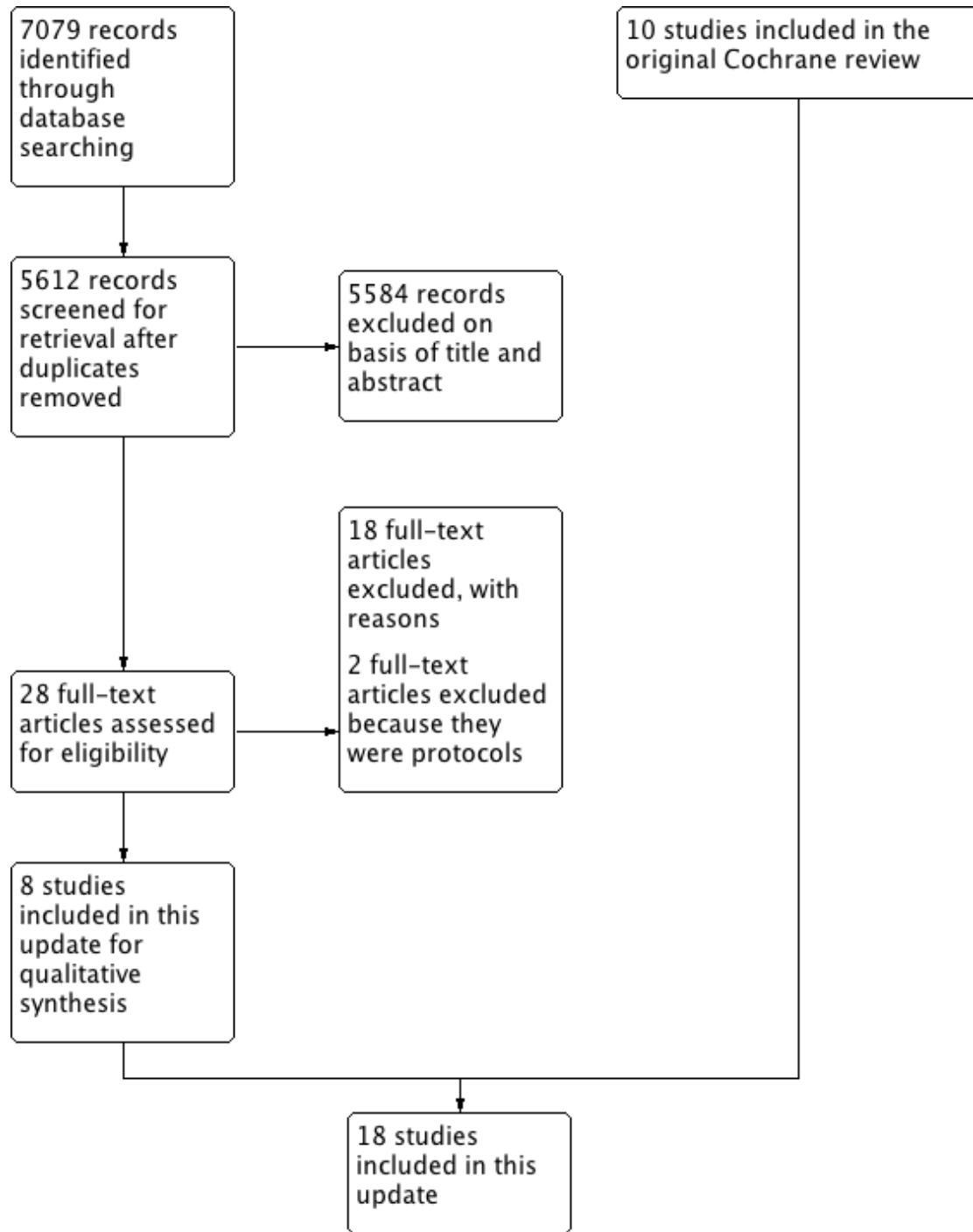
Figure 1. Flow diagram of the study selection for this update.