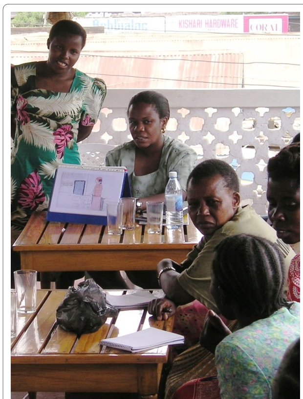
Figure 2 Reviewing an early version of the pictorial flipchart with CAC members.

These findings led to a reappraisal of informed consent procedures at the site, culminating in a variety of new approaches being tested in the MDP301 Pilot Study, including a pictorial flipchart developed through consultation with members of the Community Advisory Committee (Figure 2) and subsequently used by project fieldworkers to provide information to potential study participants at facility-based community meetings. Audio tape recordings and pictorial instructions providing information on gel use were also piloted. A site-specific comprehension assessment, which included a qualitative component and a standardised written checklist, was used to evaluate how accurately study participants were able to retain key messages relating to pilot study objectives. IDIs were conducted in order to explore comprehension and message retention in more depth. The high levels of information retention and comprehension observed during the pilot study led to a revised package of informed consent tools and procedures being taken into the main MDP301 phase III clinical trial.