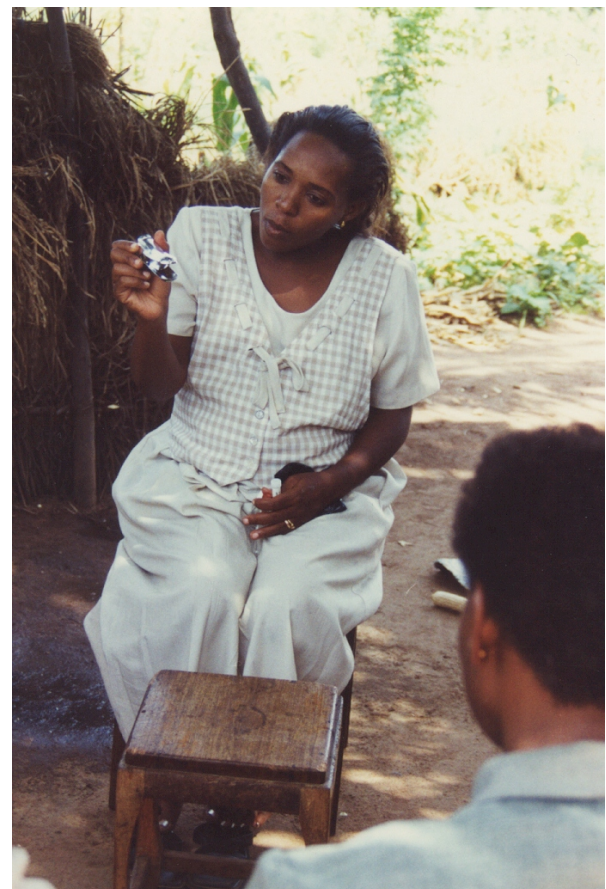
Figure 1 Fieldworker showing a speculum to women attending a facility-based meeting.

The relatively high early losses to follow-up observed during the feasibility study[25], coupled with anecdotal feedback from clinic staff and fieldworkers, and information collected from study participants in community participatory workshops, focus group discussions (FGDs) and in-depth interviews (IDIs) [34], suggested that mis-