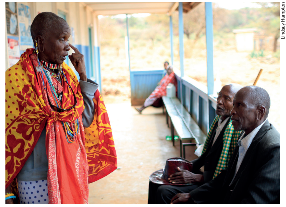
A woman tells new patients about her cataract operation. KENYA

Patients and their families must be given advice and counselling about the operation, including what happens before, during and after. They should then sign an informed consent form. It is our responsibility to ensure that