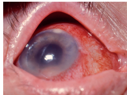
Figure 2. Endophthalmitis with hypopyon

less than 1 in a thousand to several times that figure depending on the criteria of diagnosis, and whether the cases are culture-proven or clinically diagnosed. 1 When acute, it develops in 2–5 days with pain being a prominent symptom. However, endophthalmitis can present up to 6 weeks after surgery. Ciliary injection (redness around the cornea) and conjunctival chemosis occur, and pus in the eye (hypopyon) may be visible in the anterior chamber. Immediate referral for culture and intravitreal antibiotics may save the eye. Read more online: http://www.cehjournal.org/article/postoperative-endophthalmitis