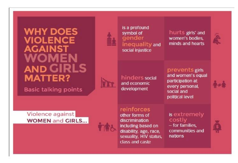
Figure 2. Example of popularization of academic research (by Raising Voices, Uganda).<sup>25</sup>

Although assurances of feedback to local communities are commonly voiced at the outset of a study, efforts often diminish towards the end when time and resources run thin. NGO/IOs are particularly well-placed and have substantial motivation to fulfil their promises and promote the rights of their constituency. In a recent call to action to address violence against