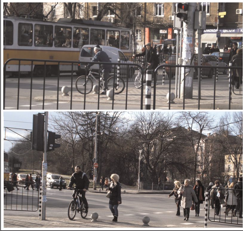
Figure 3. Tactics of crossing the Grafa and Evlogi junction, central Sofia.