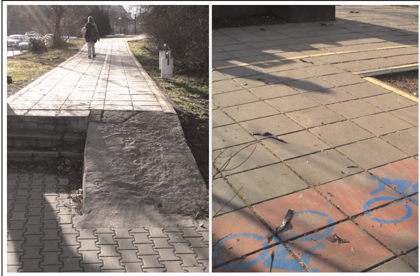
Figure 1. Cycle paths in central Sofia.