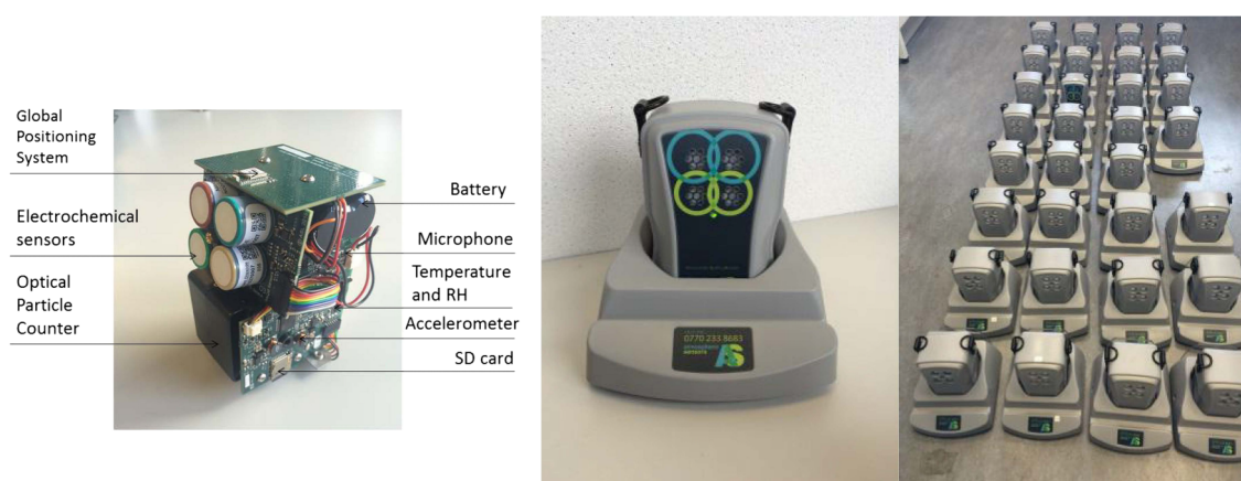
Figure 2 Design of the PAM platform internals, in charging base-station and 'en masse'. PAM, personal air monitor; RH, relative humidity; SD, secure digital.

In total, 160 participants will be recruited from CPRD using an algorithm containing validated COPD diagnostic codes. Patients with data in CPRD who have a diagnosis of COPD based on a validated code list by Quint et al 21 are not coded for mild COPD (ie, moderate or severe patients only), are not coded as a current smoker, are aged >35 years, and have had between one and two identified exacerbations in the preceding year will be included. After running the algorithm to identify suitable participants, general practices that have agreed to participate in research through CPRD will be sent a list of the potential participants. GPs will confirm to CPRD the suitable patients identified previously using the Vision Identification. CPRD will then send participant