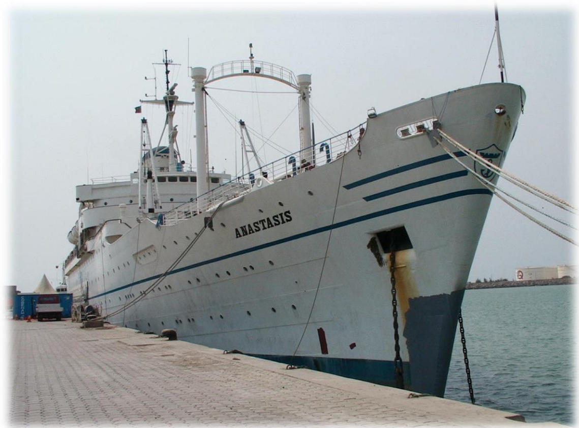
Figure 1 The Anastasis docked in Cotonou's port

aid work. Before closing the chapter with an overview of the following nine chapters, I examine the recent work within the discipline of the anthropology of medical development and the contributions of this research to the field.