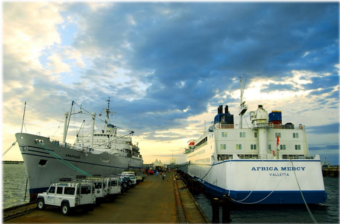
Figure 12 At the end of the Anastasis ' mission and the start of the Africa Mercy 's, in Monrovia Liberia in 2007