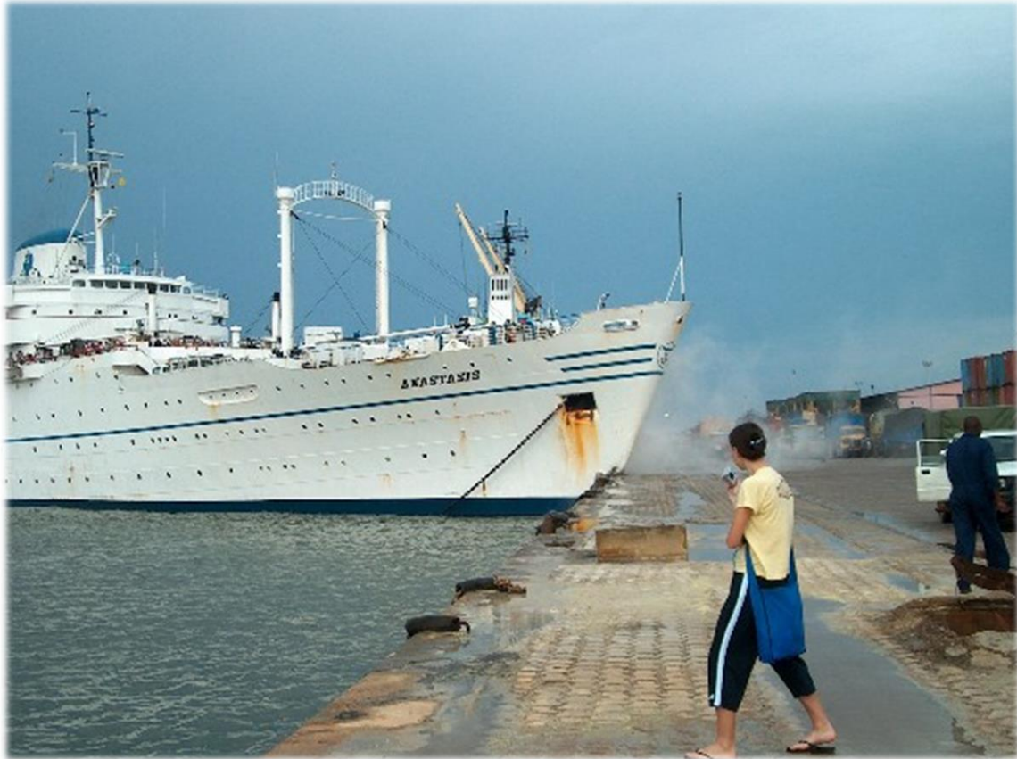
Figure 7 The Anastasis hitting the quay in Cotonou upon its sail into the port, 2004