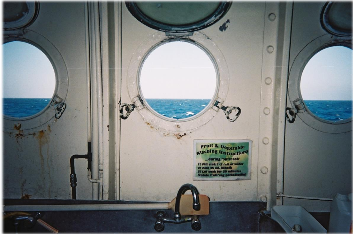
Figure 9 View from the salad galley portholes at sea

It is a Tuesday morning and I have the day off from my work in the dining room. On shift days, we get up at 5am, pull on white trousers and dark crew t-shirts and stumble down the corridors to the sleeping galley, serenely spic and span as it was left the night before. There we prepare breakfast, and, as no cooked fare is served in the morning as at other mealtimes, our team of five is alone in the kitchen and cafeteria without the additional bustle of the salad and meal crews that work from 8am to about 5 or 6pm. As a team we replenish the buffet lines with bread, fruit, cereal, peanut butter and, if we are lucky, some jars of Nutella; make sure the toasters work; refill smaller, more aesthetic jam jars from big white plastic vats; replenish the milk dispensers; and eventually fire up the industrial washing machine and dryer for the dishes that we start carrying back once our fellow crewmembers finish their meals.