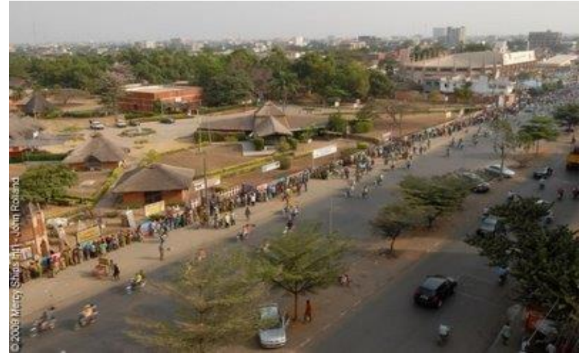
Anastasis medical screening, Cotonou Images posted to the Mercy Ships website