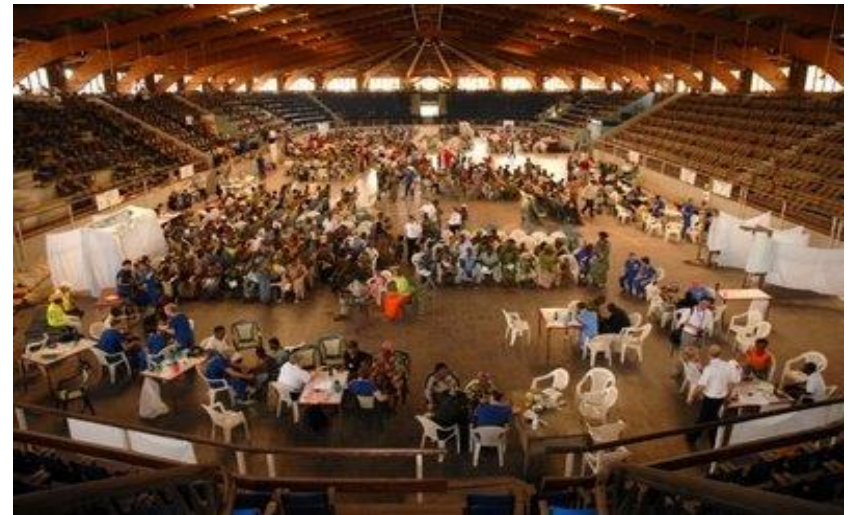
Figure 8 Four images from the Mercy Ships medical screening in Cotonou, Benin. The top two show the long lines waiting to enter the grounds and the Halle des Arts.