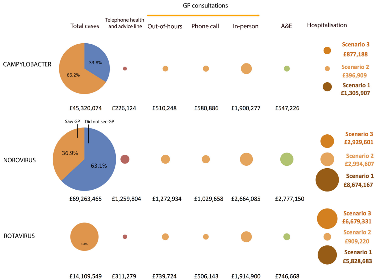
Fig 2. Estimated costs to patients and the health service due to Campylobacter , norovirus and rotavirus disease in the United Kingdom, 2008–9. Area of circles is proportional to the estimated cost