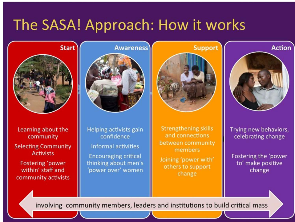
Figure 1 Four phases of SASA!