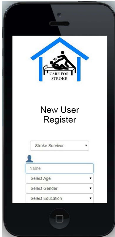
Figure 3 Registration page.

performing brushing, feeding, dressing, etc. Please find the section web page in figure 6 .