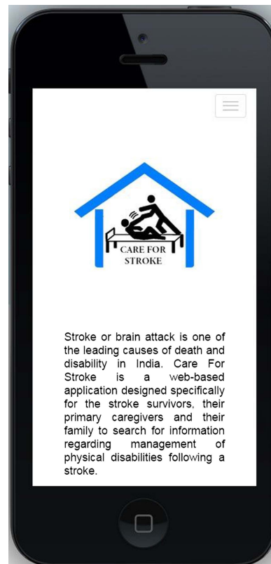
Figure 2 Introductory page of the 'care for stroke' application.

This application is exclusively designed to support digitised audio-visual content. More than 75% of the content of this application is in the form of videos. The users can interact with the images related to the main sections and watch the videos about stroke and the management of physical disability post-stroke