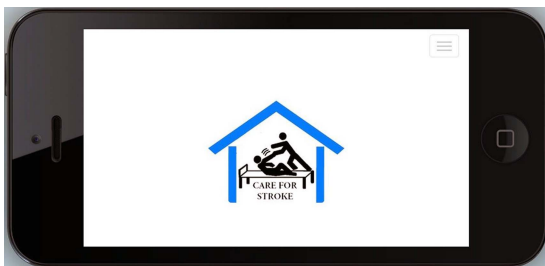
Figure 1 Logo of the application.

The tagline of the application is 'Think Smart—Take Control'. This tagline emphasises the importance of proactive, innovative and smart planning for therapy and rehabilitation services that the stroke survivor and their caregivers should execute, outside the hospital environment. It also encourages the stroke survivors to take control of their problems following stroke and work towards an independent life after a stroke.