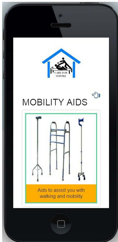
Figure 6 Subsection page.

patterns of this application by the users can be tracked continuously and reports can be generated to inform the feasibility of this intervention and also to monitor the progress of any programmes/research projects related to this intervention when scaled up to a larger community of stroke survivors. The administrator can also add videos onto (or remove videos from) the application as and when required, thereby customising or improvising the content of the intervention according to the needs of the users. The module is protected and strictly secured through a username and password to ensure privacy and confidentiality of the user information.