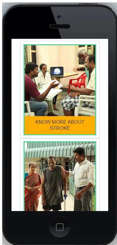
Figure 4 Intervention page.

This Smartphone-enabled intervention is built with an administrator module, where the usage and utilisation