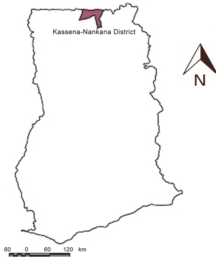
Fig 1. Map of Ghana indicating study area.