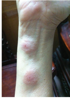
Fig. 2: local skin reaction to the bite of Triatoma rubrofasciata (photo by one the authors, TXL).

of polymorphic DNA was discovered recently in another species of triatomine bug, Linshcosteus karupus in India (Miles 2013). In the recent surveys in Vietnam, trypanosomatid forms have been recognised in the intestine of the bugs at a high frequency (50-90%); the parasite is not definitively identified, although its general morphology indicates a Megatrypanum species such as T. conorhini .