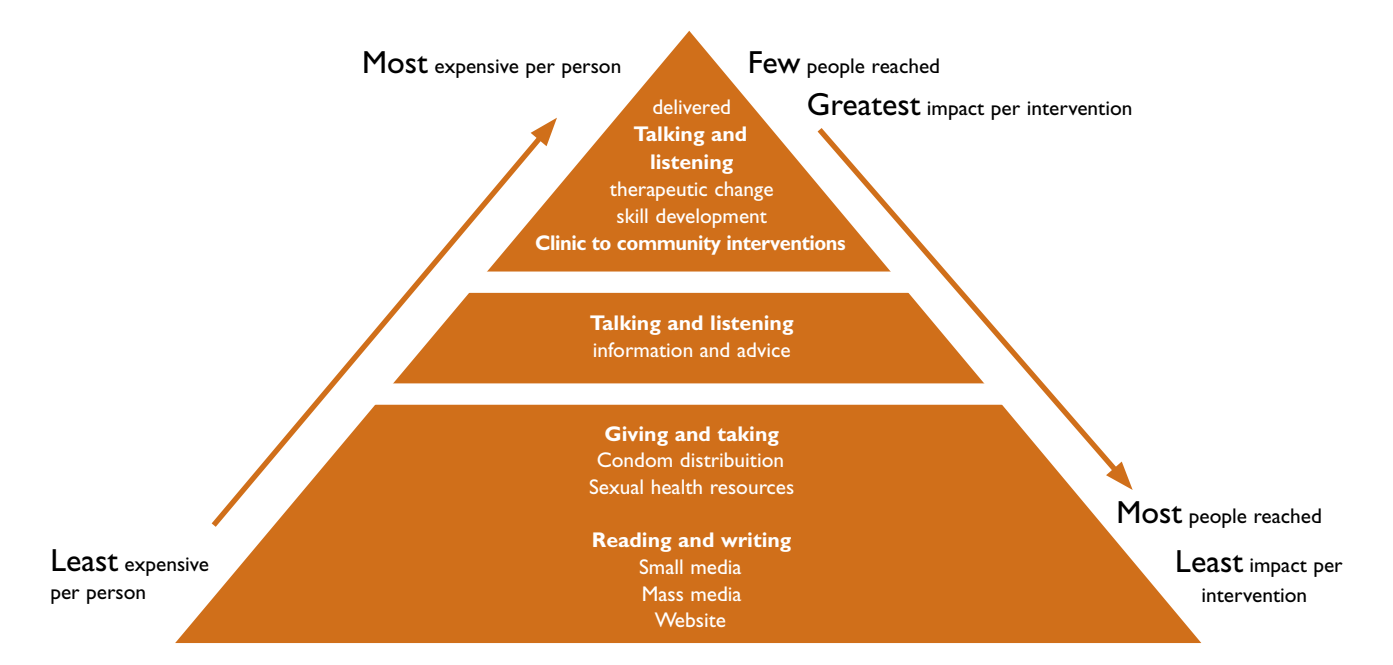
Figure 2.4b: Cost, efficacy and scope of an array of direct contact interventions

Each one of the aims listed here will require a considerable number of needs to be met, and an intervention may be designed to focus on a particular sub-aim of one of these larger aims. For instance, in order to reduce sexual HIV risk behaviours (Africans aim I), African people will need to know that HIV exists, the harm it can cause, and how to reduce risk; they will need the motivation to reduce the risk of transmission, and the power to act to reduce HIV transmission risk (see chapter 6 of KWP for greater detail on all of these aims and their related needs).