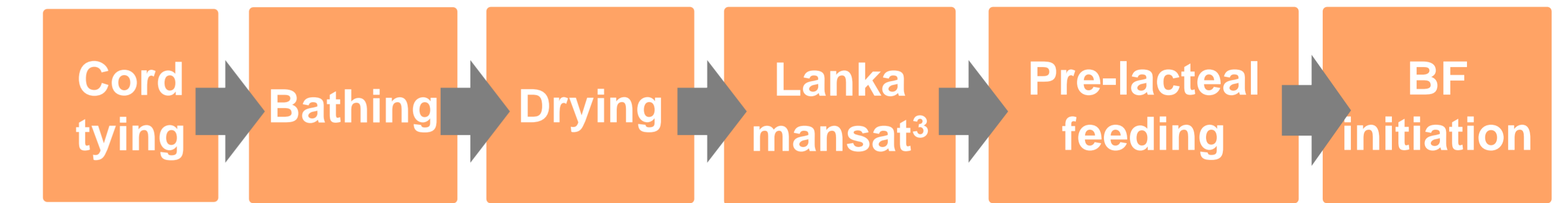
Fig 2: Sequence of newborn care practices following birth

Finding: There are other competing newborn care practices which have more cultural values to mothers