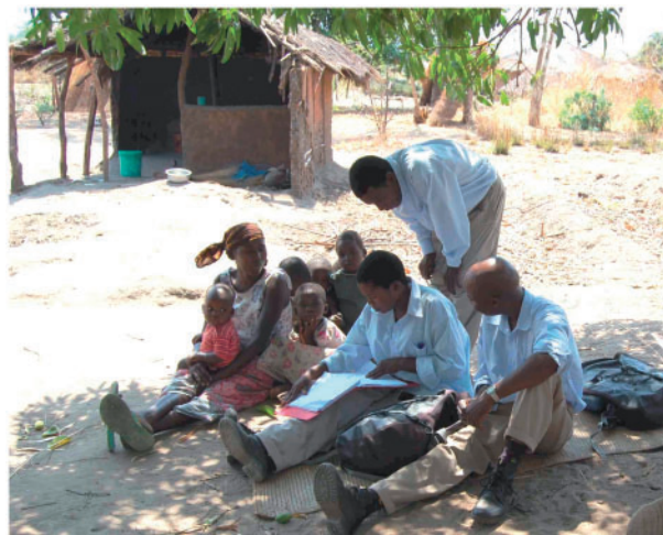
Photograph 1 Karonga HDSS—survey team recruiting family for survey (written consent obtained from participants).

Research plans for the near future include an expansion into the area of non-communicable diseases, particularly diabetes and hypertension (which account in part for an increasingly high burden of disease in this setting), an increased emphasis on intervention studies and establishment of an urban partner site in Lilongwe.