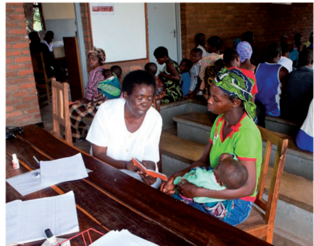
Photograph 2 Karonga HDSS—nurse recruiting mother and child for paediatric disease surveillance in health facility (written consent obtained from participants).

At the end of 2011, 35 730 individuals from 8285 households were under observation in the Karonga