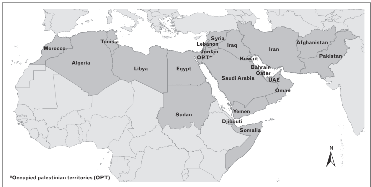
FIGURE 1. Map of the MENA region including the countries that are covered in this review. MENA, Middle East and North Africa. Reproduced with permission from [2].

The most distinctive feature of the epidemic in MENA that manifested itself in the new data is the rising HIV epidemics among key populations including people who inject drugs (PWID), men who have sex with men (MSM), and to a lesser extent female sex workers (FSWs) [8*,9*,10]. The majority of the epidemics appears to be relatively recent with emergence within the last decade. Most epidemics appear to be growing with a trend of increasing HIV prevalence in multiple countries. Table 1 displays HIV prevalence among key populations per the most recent available IBBSS studies;