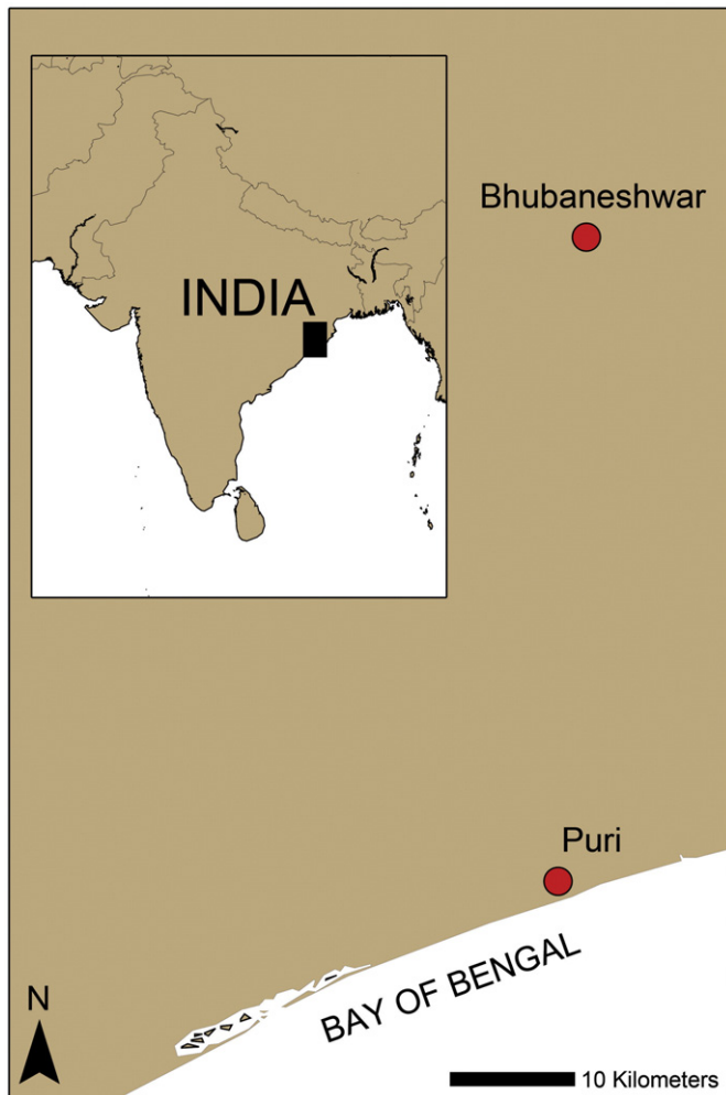
Fig. 1. Overview map of the study area in Odisha, India, where fecal samples were collected for comparative testing of different Bacteroidales assays.

the performance of 41 assays against 64 blind fecal samples in 27 laboratories. Drawing on this comprehensive evaluation, we identified the remaining candidate human- (HF183 Taqman, BacHum, HumM2 and BacH), ruminant- (BacCow), cattle- (CowM2) and dog- (BacCan) associated assays. Note that BacCow was reclassified as a ruminant-associated assay (Raith et al., 2013). For the two candidate universal/general Bacteroidales assays, we compared BacUni and GenBac3. BacUni has been reported to perform well not only in the US but also in a developing country, Kenya, where people have a very different diet from the US (Kildare et al., 2007; Jenkins et al., 2009; Silkie and Nelson, 2009). GenBac3 markers were reported to be abundant in human sources and 20 representative animal sources collected across the US, using a large number of test samples ( n = 223 ) (Kelty et al., 2012).