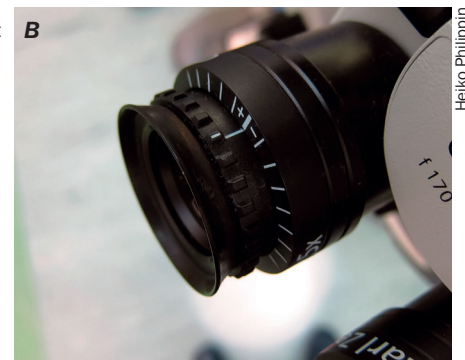
Preparing for surgery also includes the small details. If the microscope is not set up correctly (A), it will compromise the surgeon's view during the procedure. B shows the correct setup.