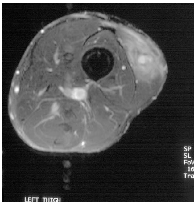
Figure 3. Magnetic resonance image of thigh with Gnathostoma larva (case 4).

In our patients, the median time from onset of symptoms to diagnosis was 12 months, which reflects both the intermittent, episodic nature of the symptoms and the