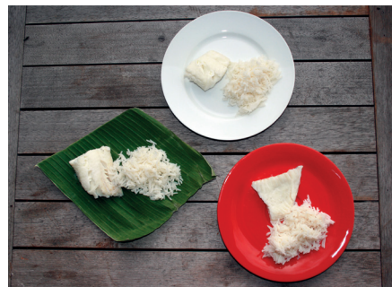
Figure 2. Using contrasting colours to improve visibility