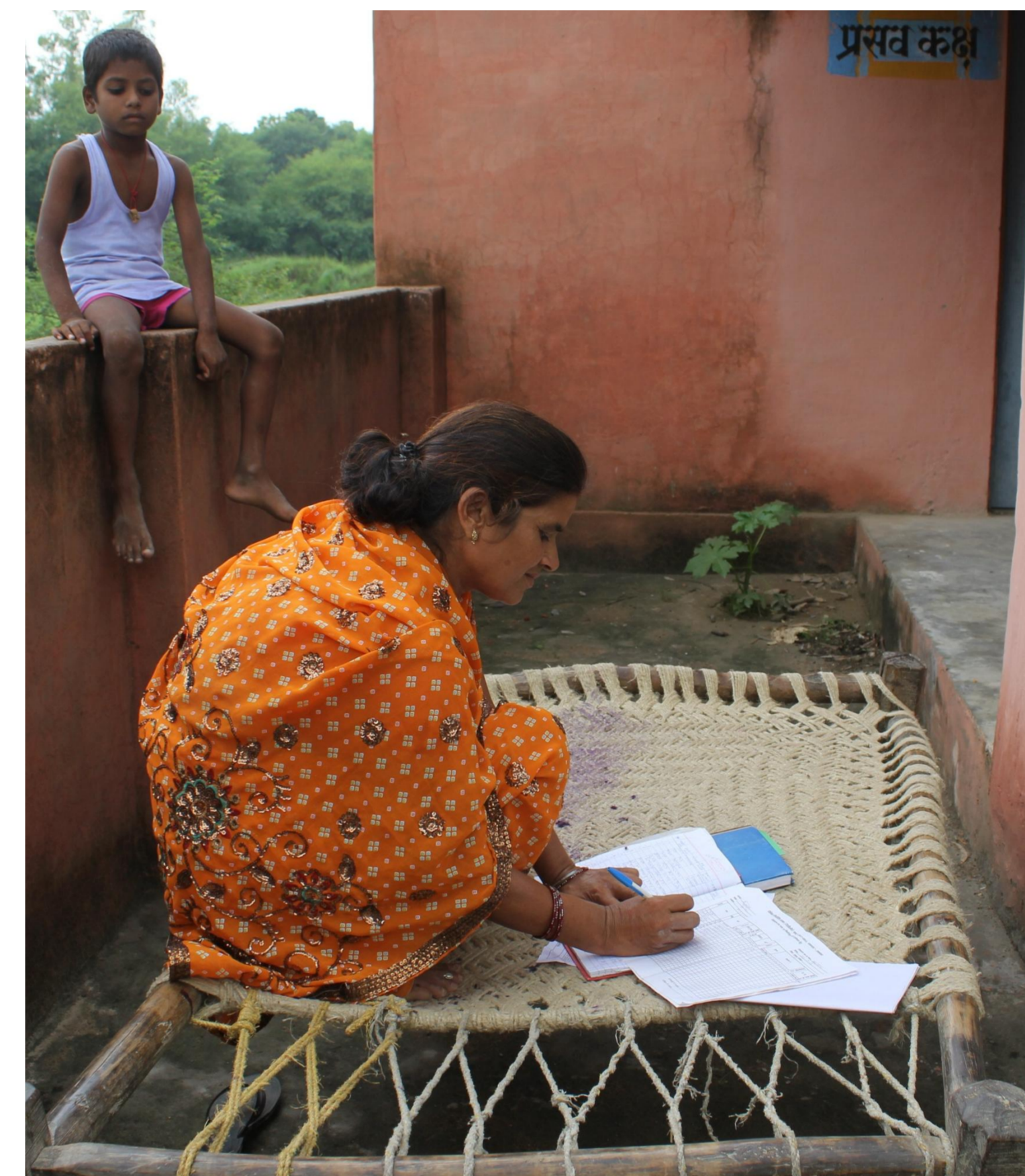
Woman adding data to a health form in Uttar Pradesh, India

Decision making tools and the processes involved in reaching a consensus at district level are usually used for resource allocation, priority setting, planning and implementation of district health plans, and personnel management.