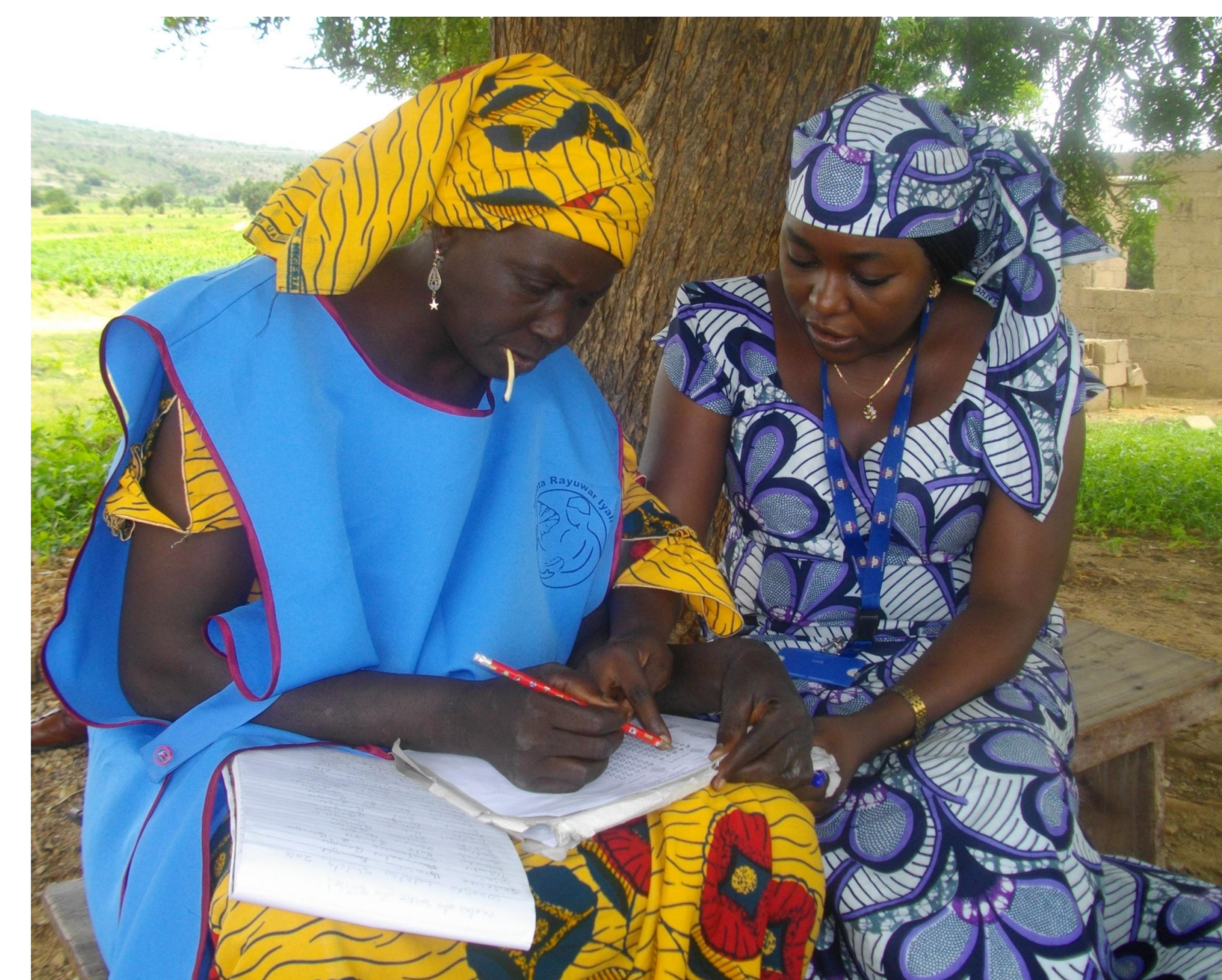
Data collection in Gombe State, Nigeria

The study findings will offer some guidance for developing and testing a methodology for district decision making that will also be made available for general use and adaptation in health systems in developing countries.