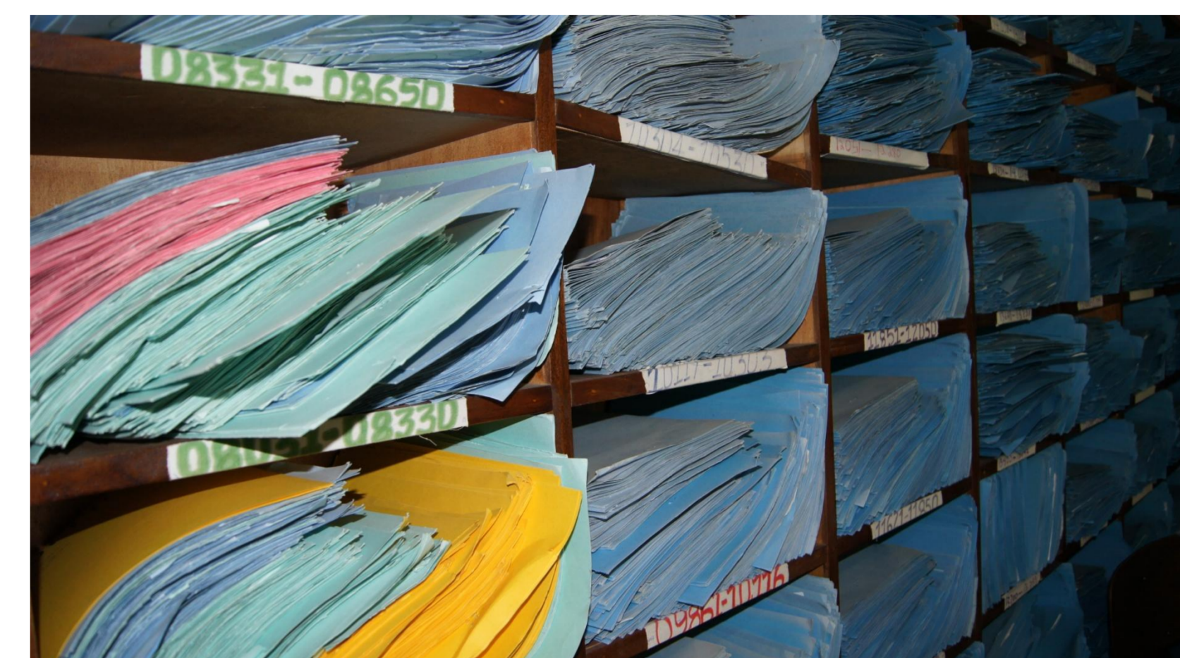
Data files in Ethiopian health centre

All standard practices for a systematic literature review are being followed, including two independent reviewers and maintaining an activity log of each step taken throughout the process.